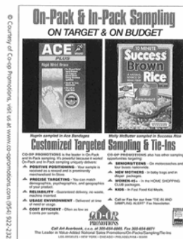
Figure 18.1 On- and In-Pack Sampling frequ samp

Mea culpa. Will you (sob, sob) ever believe me again?