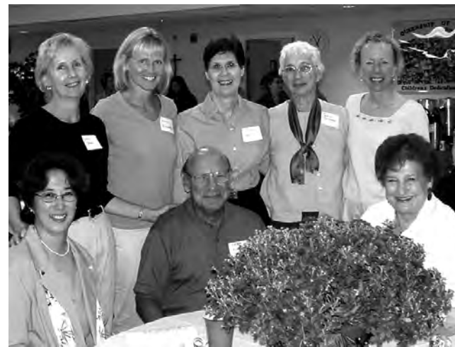
New Jersey Unit volunteers recorded 9,614 hours, adding more than 400 titles to the CV Starr Learning Through Listening Library during fiscal year 2006.

The New Jersey Unit and RFB&D members throughout the Garden State would like to extend a special thank you to The State of New Jersey for its continued support of our Educational Outreach effort.